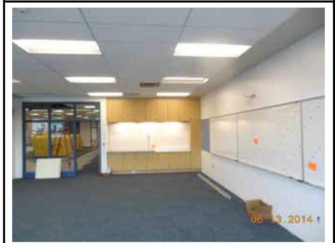
Lights on and marker boards installed in classroom