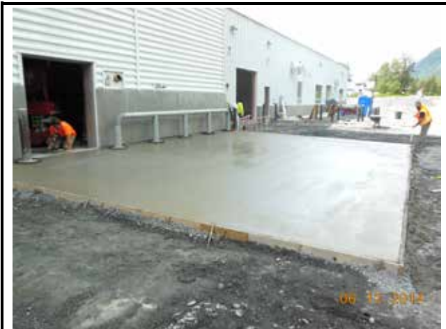
Finishing concrete slab for dumpsters