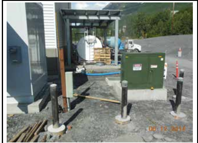
CVEA transformer activated for MS