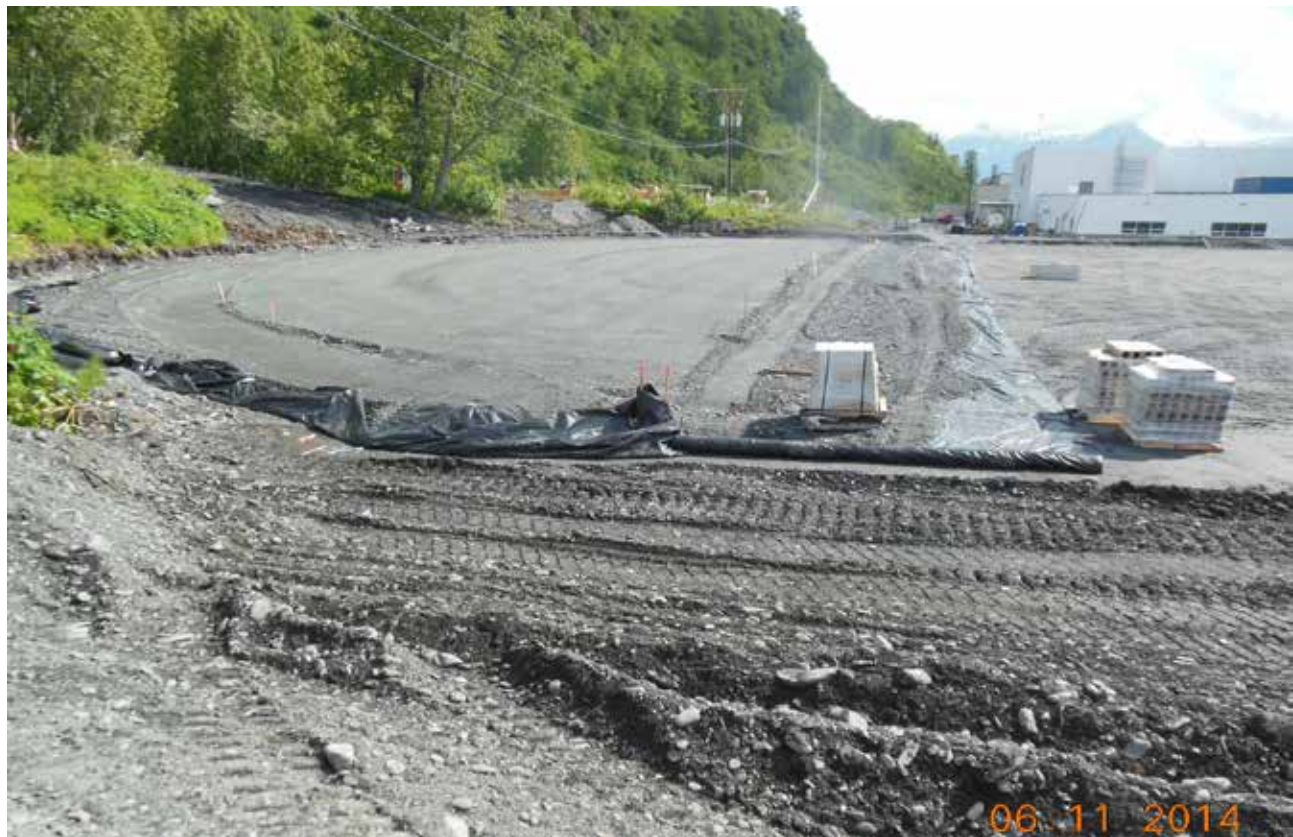
Subgrade prep for north end of running track and D-zone; layout and prep in progress for perimeter drainage system.