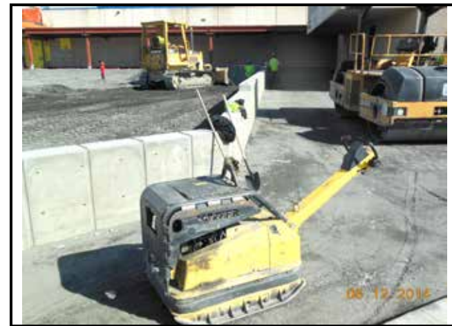
Compacting fill placed around seat wall near HS