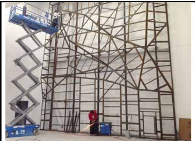
Welding structural frame for climbing wall in Mat room