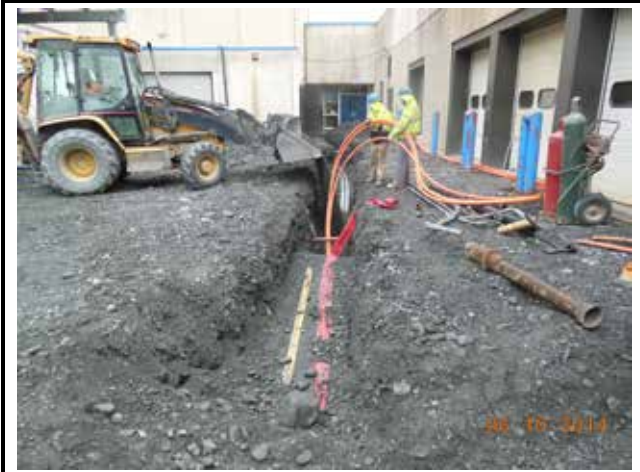
CVEA conduit and conductor to new transformer for HS