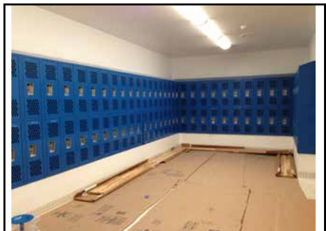
Lockers were installed; benches to follow