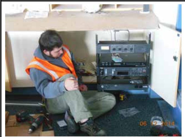
Installing sound system equipment in Reception area