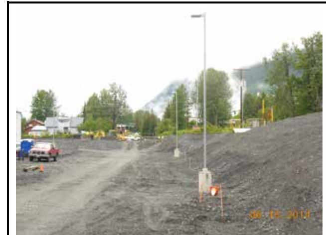
Protective collars were set and light poles were erected