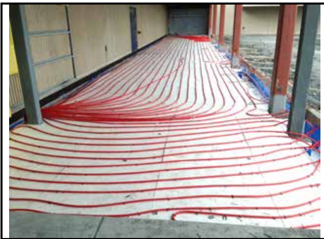
Radiant heat tubing on rigid insulation for HS walkway