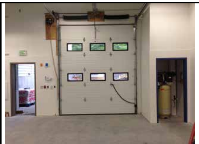
Roll up doors were installed (above at CTE)