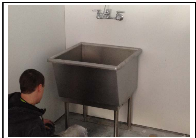
Installing stainless steel sink in CTE area