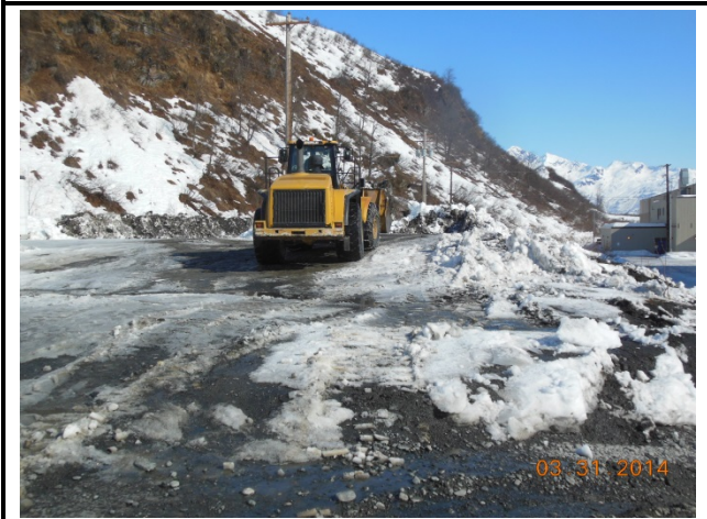
Removing snow and ice along water line route