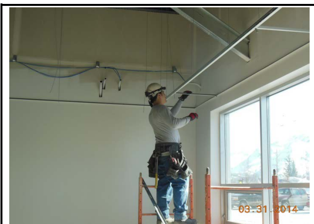
Starting grid for acoustical ceiling tile in classroom