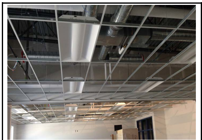
Grid finished and light fixtures installed in classroom