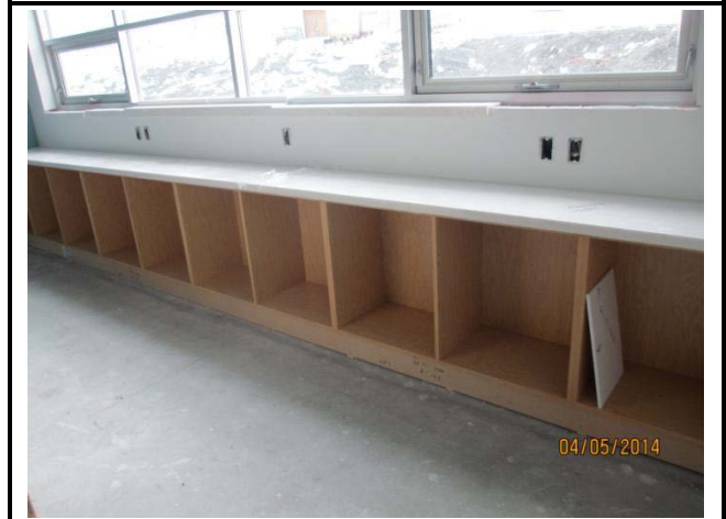
Installing casework below Science windows