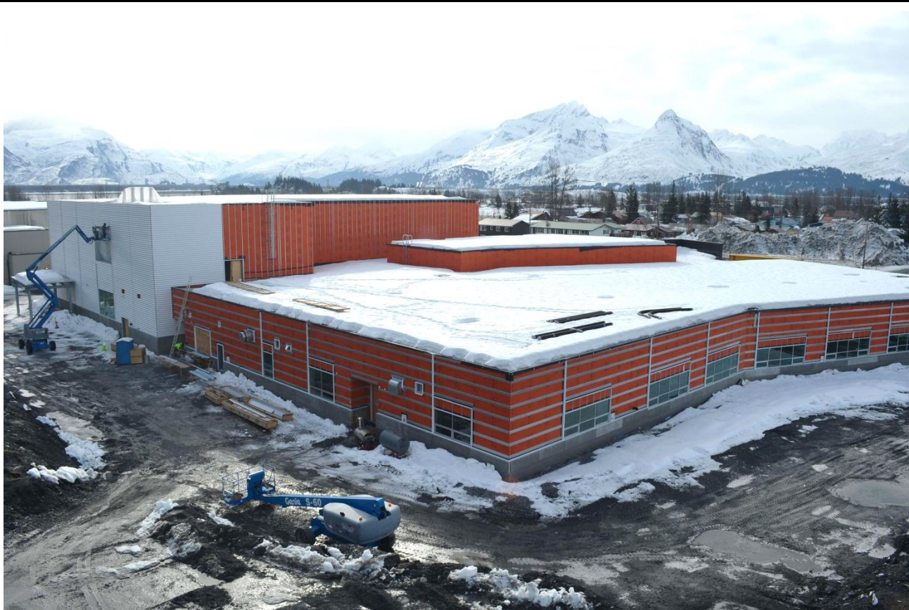
Attaching metal siding (at left) on hat channels along north side of Mat room, Fitness and Mechanical areas (DCI image)

Dawson continued installing metal siding and flashing on the north and east walls. Inside, Dawson continued preparing floors for tile, started installing athletic equipment in the Gym, installed plywood on Shipping & Receiving walls and performed other rough carpentry as needed. Megawatt continued pulling wire for controls, installed lighting fixtures in CTE and the Gym and trimmed wall receptacles at classrooms. Integrity pulled data cable at Admin, Commons, the Gym and CTE areas, assembled equipment racks in upper (main) Comm. room, and pulled "backbone" cables from upper to lower Comm. room. Mantech installed fuel piping; seismic restraints and smoke sealed pipe penetrations in the Boiler room, installed piping to air movers in the Penthouse, and started installing sinks, fountains and toilets. All Wall finished hanging GWB in the Mechanical stairwell; continued sound caulking, continued taping and sanding the west side, Mechanical stairwell and Mat room; finished painting NW area classrooms and started installing ceiling grid in classrooms. Commercial Contractors continued preparing floors, installing and grouting ceramic floor and wall tile in toilet, locker and shower areas. Harris Sand & Gravel removed snow and ice around the building's west and north sides. This will help thaw the ground prior to excavation for the water line and permanent utilities.