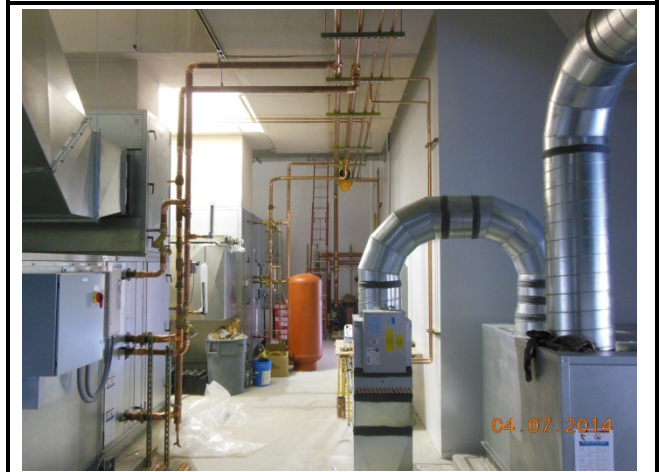
Installing piping for air moving equipment in Penthouse