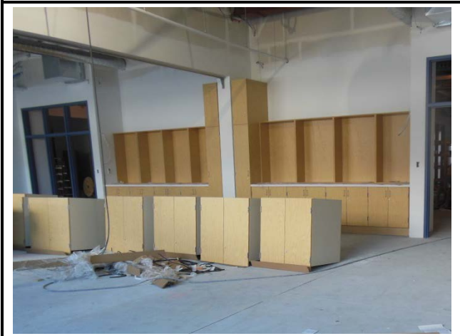
Installing casework in 7 th Grade classrooms