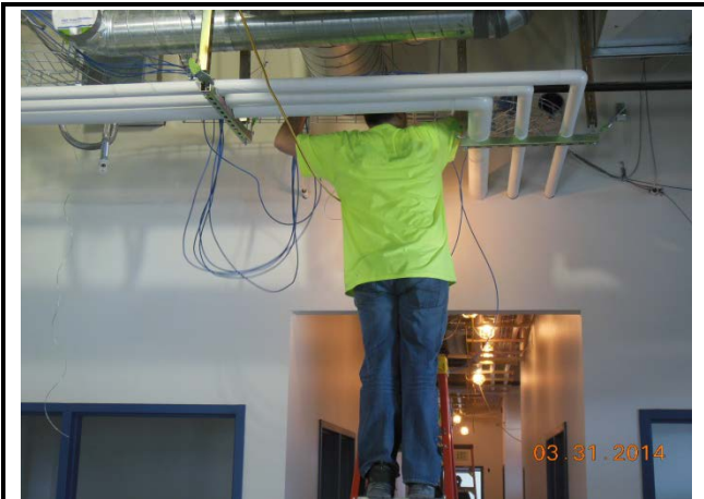
Pulling data cable in the Admin area