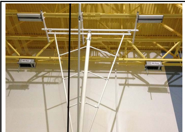
Installing backstops, mat hoists and lights in the Gym