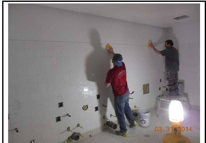
Grouting ceramic wall tile in Toilet room