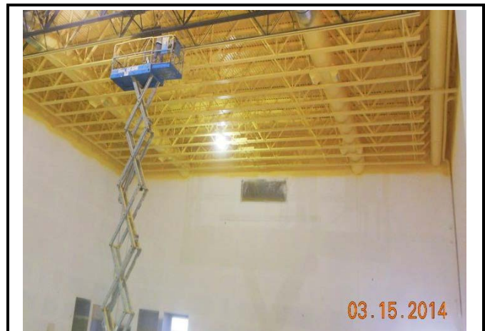
Spraying "dry fall" paint on Gym trusses, duct and ceiling