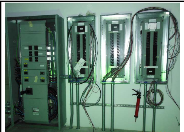
Service disconnect gear (left) and panels in Electrical Rm