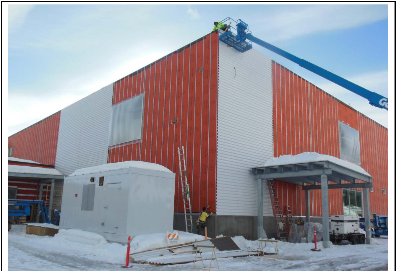
Installing horizontal metal panel (MP-2) siding on hat channel along east wall of Gym (left) and north wall of Mat room.

Dawson staged, inventoried and started installing metal siding and flashing along north and east sides of building. Inside, Dawson installed plywood on walls for Gym storage, installed sleeves in Gym floor for volleyball and badminton posts, adjusted door frames, performed other miscellaneous rough carpentry and layout. Megawatt continued work on main panels in Electrical room, terminated panel boards in Admin area, pulled control wire to VAVs, and started installing fixtures in Gym and hard ceilings. Integrity continued installing J-hooks and pulled data cable for classrooms. Mantech unloaded and set boilers in the mechanical room, continued work on heat mains and started connecting pipe to hot water generators. H&H Sheetmetal installed dust collector drops in CTE ducts, connected supply and exhaust ducts, and connected exhaust stacks to boilers. All Wall hung sheetrock on walls at the Cafeteria, Kitchen, Shipping and Receiving and Special Education, various ceilings and soffits, installed sound insulation and caulking; finished taping and sanding Gym and classrooms; finished painting Admin area, continued painting the Gym and started painting classrooms. Alaska Glazing installed the curtain wall frame and half the glazing at the entry.