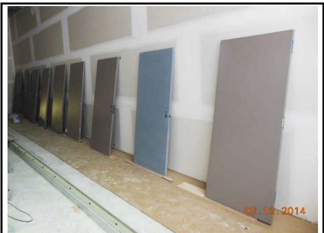
Exterior metal doors painted and drying in Fitness room