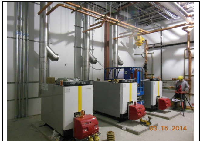
Boilers set on housekeeping pads in Mechanical Room