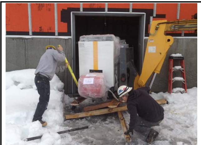
Sliding boiler unit through door to Mechanical Room