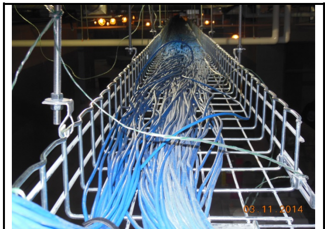
Close-up of cable bundles in tray suspended from structure