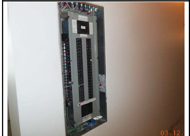
Wires neat and terminated in panel LR-3