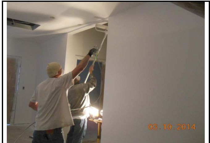
Spraying paint on walls followed by rolling (typical process)