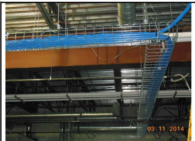
Data cable in trays above ceiling in classroom area