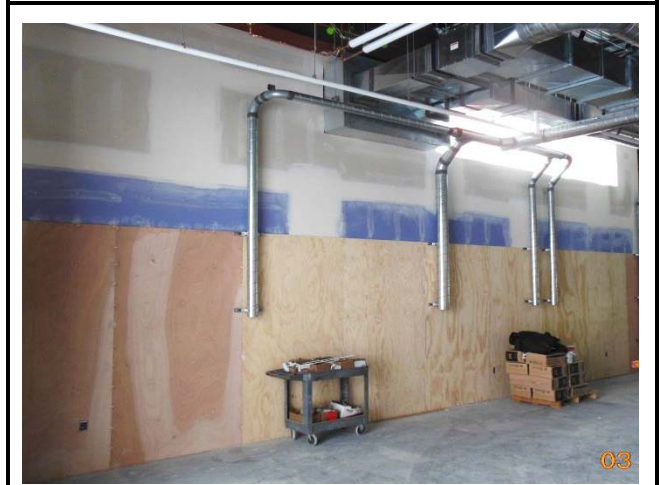
Dust collector drops attached to plywood walls in CTE