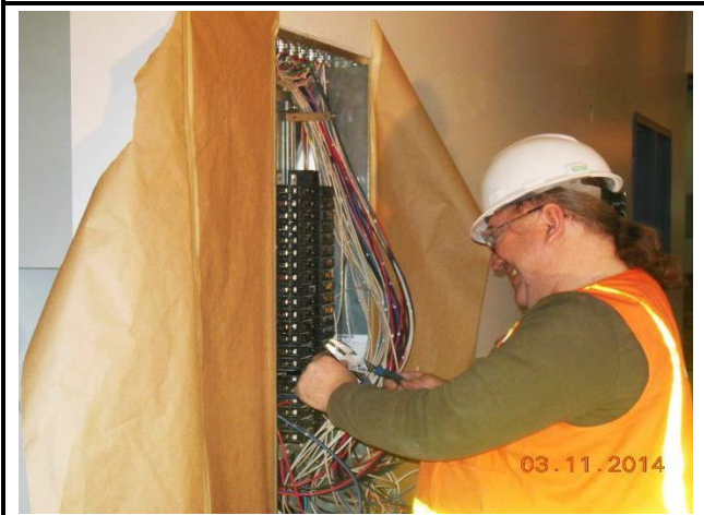
Terminating Admin area power circuits at panel "LR-3"